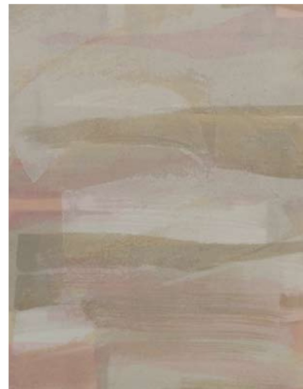
Essens I 36 x 46 cm. Teknikk: Akryl