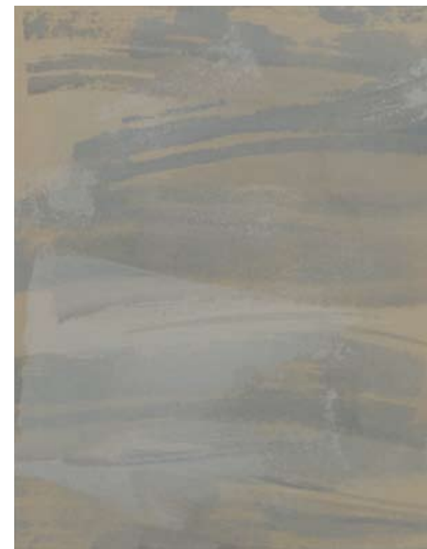
Essens II 36 x 46 cm. Teknikk: Akryl

Europas nordligste bosetning. Et radiostille område. Plassert i Kongsfjorden på Spitsbergen med en distanse fra Nordpolen på 1231 km. Kings Bay AS eier og driver et moderne internasjonalt sentrum for arktisk forskning og miljøovervåkning. All ferdsel utenom bebyggelse krever at en bærer rifle, i tilfelle isbjørn.