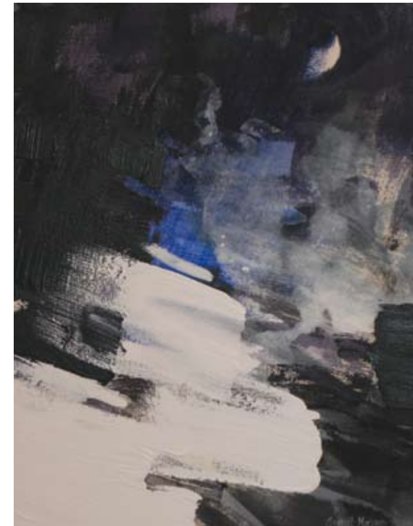
Situasjon 36 x 46 cm. Teknikk: Akryl