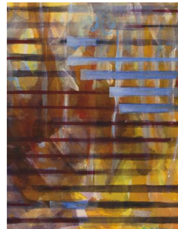
Observasjon 36 x 46 cm. Teknikk: Akryl

Det viktigste senteret for ortodoks kultur i Finland. Et lite og aktivt kirkesamfunn drevet av munkar. Frivillige arbeidere er velkomne. Mangesidig opplæring og kurstilbud. Egen konservatorisk avdeling for ikoner. Over 160 000 besøkende på årsbasis. Klokkene 22.00 går lyset på området, stillheten kan synke inn.