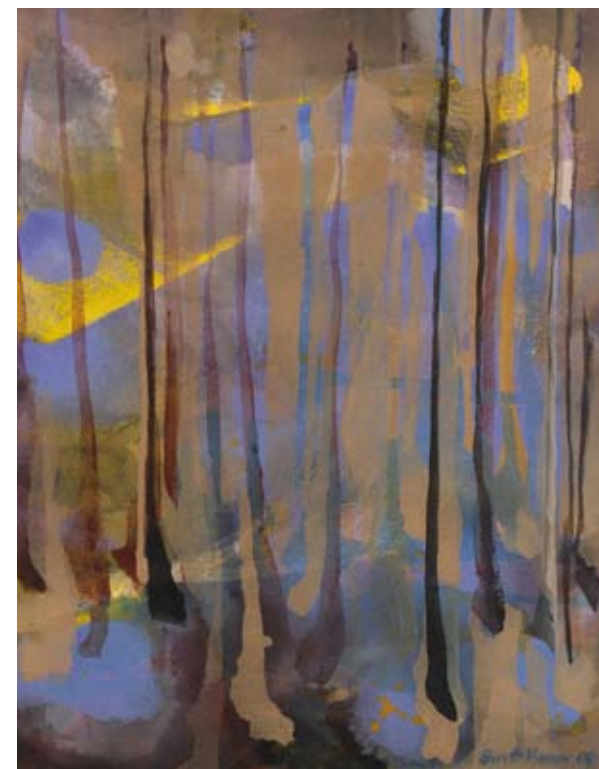
Skog 36 x 46 cm. Teknikk: Akryl