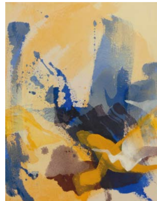
Liten 36 x 46 cm. Teknikk: Akryl

Omfavnet av Skagerrak og Kattegat. Kjent kunstnerfelleskap mot slutten av 1800-tallet. Klitgården Refugium – opprinnelig kongelig sommerresidens. I dag et arbeidssted for kunstnere og forskere. Herlig å kunne gå barbeint til atelieret.