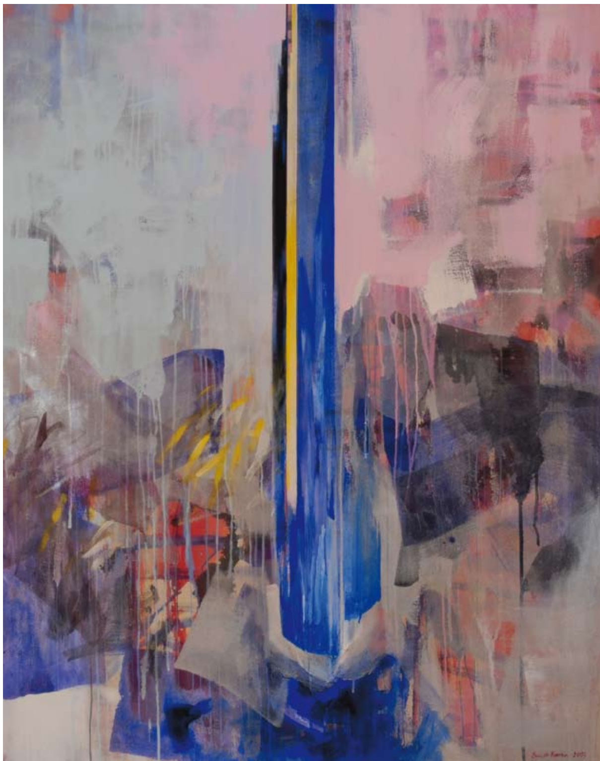
Tonus 115x 145 cm. Teknikk: Akryl