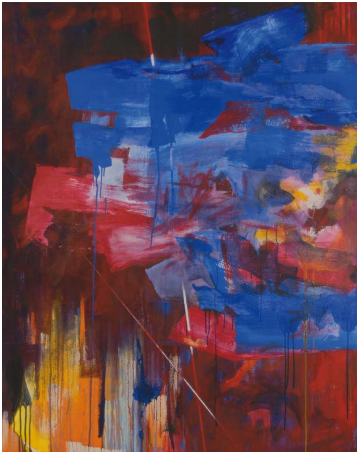
Front 115 x 145 cm. Teknikk: Akryl