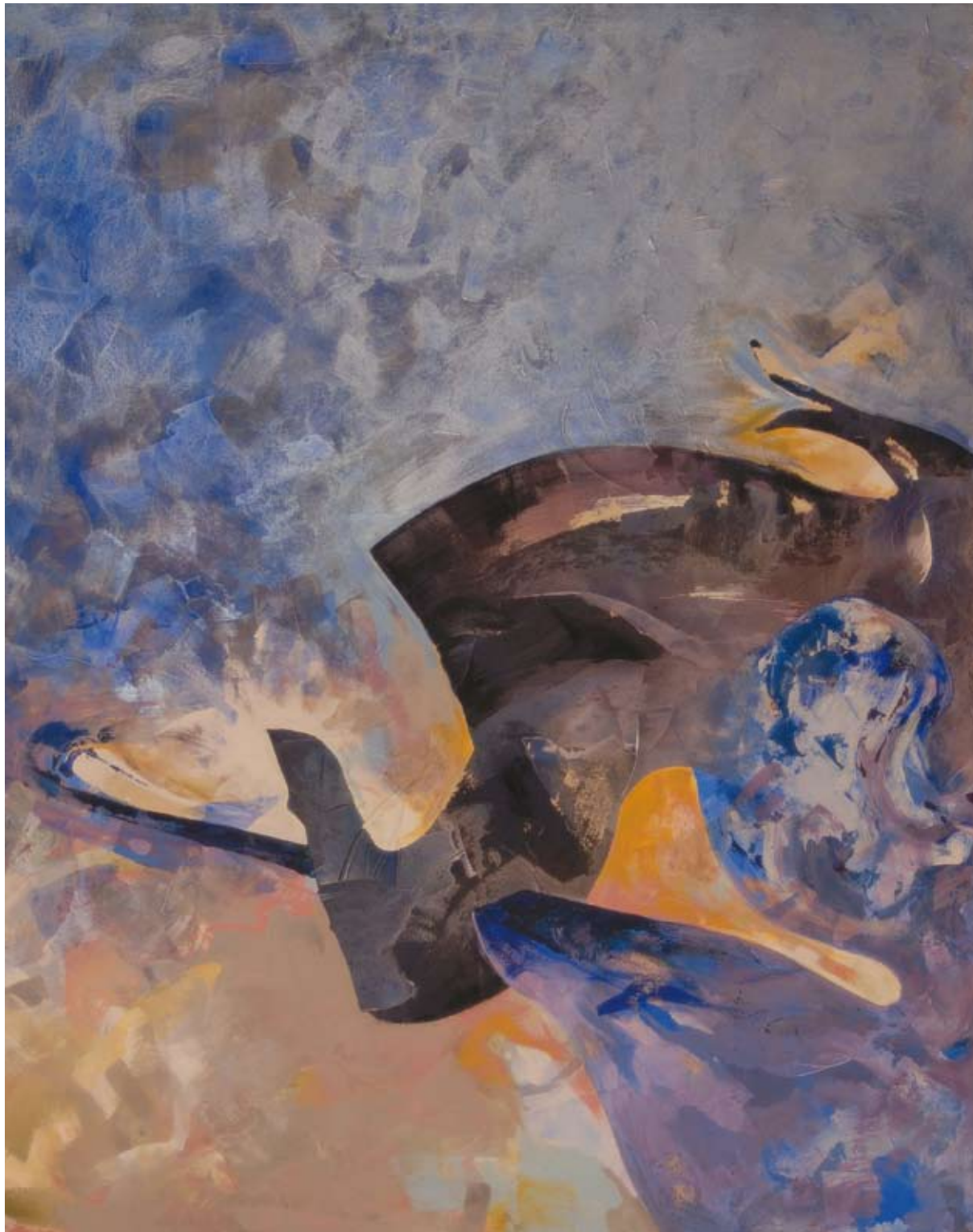
Moment 120 x 145 cm. Teknikk: Akryl