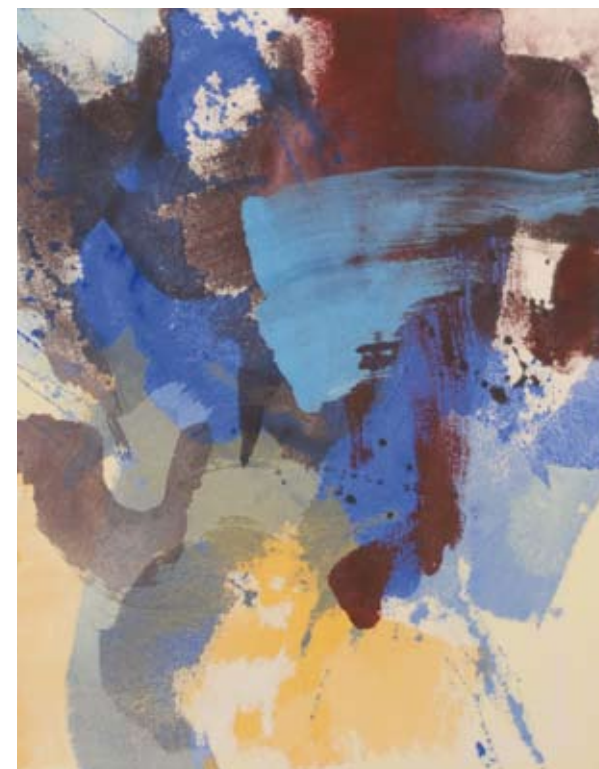
Strå 36 x 46 cm. Teknikk: Akryl