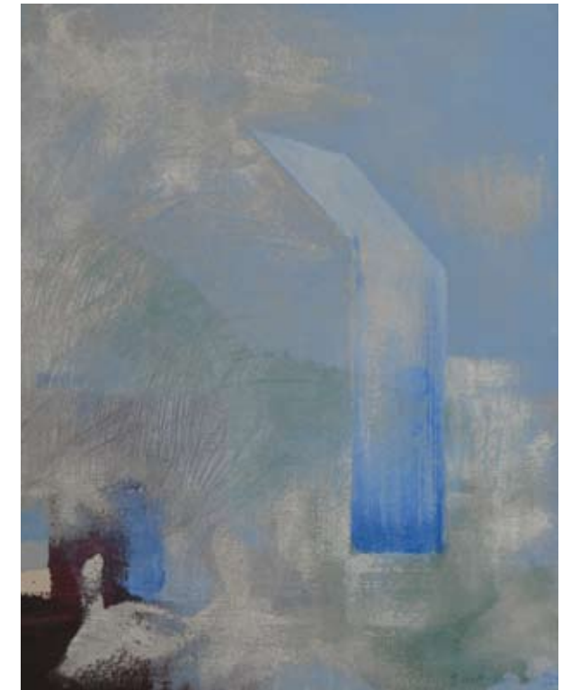
Konsept 36 x 46 cm. Teknikk: Akryl

Hafnarfjörður, en forstad til Reykjavik som i år feirer 100 år. Plassert i lavabeltet. Kjent for tilstedeværelse av alver og andre mystiske vesener. Hafnarborg, et etablert kunst- og kultursenter. Uendelige variasjoner innen svømming og bad, ute eller inne med temperatur 35 grader pluss. Nydelig fersk fisk.